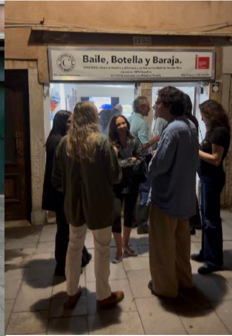
Pre-Opening Days, Tournament Days.