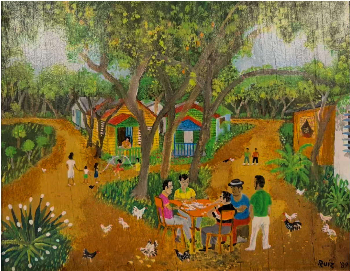
Jose Ruiz. Domino Game, 1989. 11" x 14" inches . Aurora Paint, Nail Paint / wood